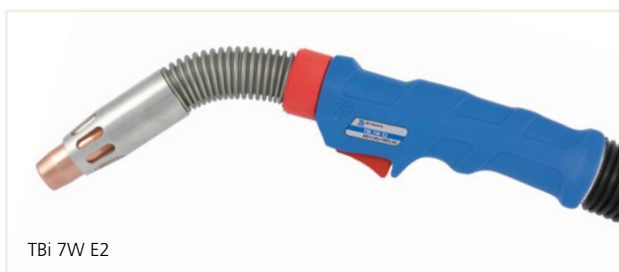
TBi 7W E2

TBi Industries present you a considerable variety of torches. Therefore, you can always find the right torch type for you regarding capacity and size of the torch.